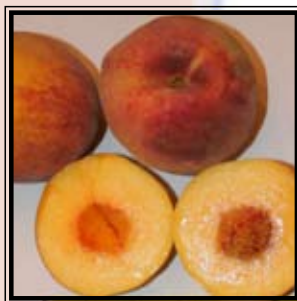
PF Fashionably Late™

This astonishing variety ripens 41 days after Redhaven and has performed so well for so many years that in my old age I have named it PF Legendary™. It has super fruit quality, flavor, sweetness and colors well for a late peach. It produces high yields of large bac spot resistant fruit.