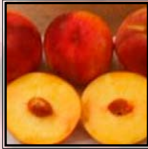
PF Late 8 Ball™