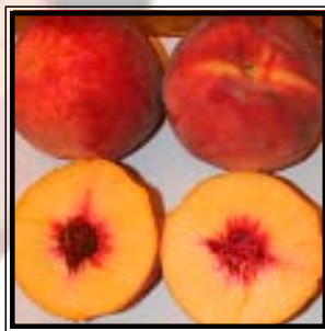
PF Paramount 24™

I believe that in a few years PF Late 8 Ball™ will have out sold all of my other varieties because of it being a freestone ripening several days ahead of the Redhaven season with such amazing quality, sweetness and great flavor.