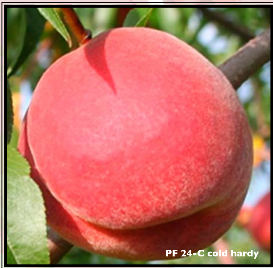
PF 24-C cold hardy

PF 24-C cold hardy , 22 days after Redhaven. This extraordinary peach had to be thinned very hard in 1999 when a winter freeze in Southwestern Michigan wiped out all other varieties. Then in 2002 there was a very late spring freeze, May 21st, and 15 varieties all around this cultivar failed and it again had a full crop. This peach is large, firm, highly colored, bacterial spot resistant, and has excellent, rich flavor. I believe this one to be of special interest to anyone with a questionable peach growing location and can be grown in several zones. The fruit has much better size and quality than other varieties thought to be hardy such as Reliance and Madison. April 4th of 2007 we had a very cold night with temperatures below 20 degrees F. and several nights in the low twenties following a very warm week. The preceding week of warm weather brought the blooms to an almost open state. This variety, deliberately planted in the lowest place on the farm, again, came through with flying colors