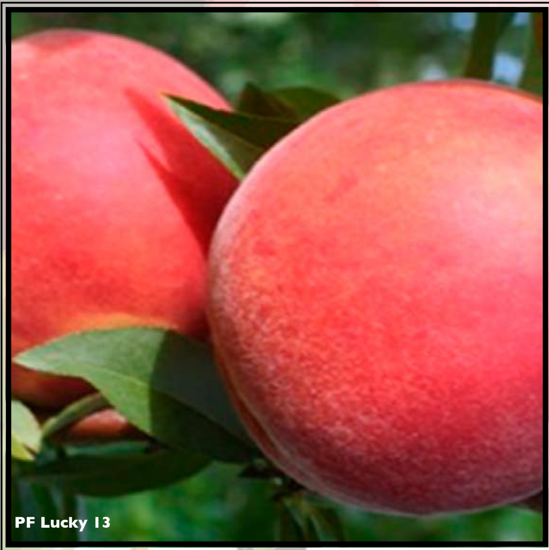
PF Lucky 13

PF Lucky 13 It ripens 5 days after Redhaven and is completely freestone. In my 45 years of searching for the perfect peach I find PF Lucky 13 to be in my top 3 candidates. PF Lucky 13 is my most popular peach variety. Many growers from Washington State to New Hampshire have reported that in the second or third leaf that have had particularly large crops of exceptional fruit and subsequently planted a second block of PF Lucky 13 the following spring. The fruit remains on the tree more than 10 days after one might think it should be picked, similar to PF 23. It just keeps getting bigger and bigger remaining very firm. Almost all of the fruit from this variety is No. 1 quality. The tree is spreading, and very productive with good resistance to bac spot.